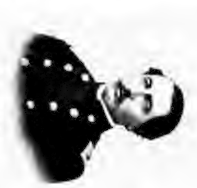
STATION AND SOMEOURS